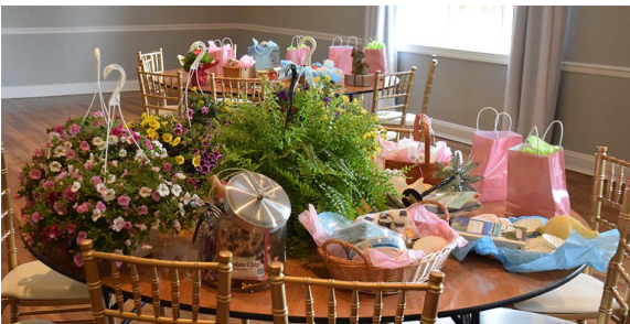
Raffle proceeds benefit the Kids and Scholarship Funds.

CecilRSPA's influence is directly related to the number of our members. Your membership is a vital component to our voices being heard